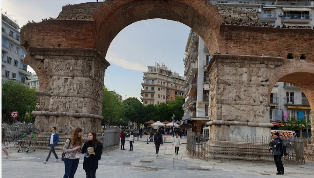
»»» How we spent one day in Thessaloniki during our Greece vacation.